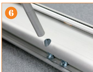
6. Insert the pole into the base.