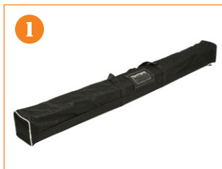
1. Cube carry bag.