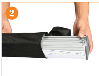
2. Take out the base from the bag.