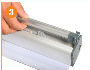
3. Take out the pole from the base.