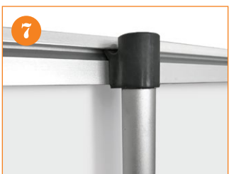
7. Attach the top bar on the top clamp profile.