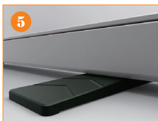
5. Turn the foot sideways to secure the base.