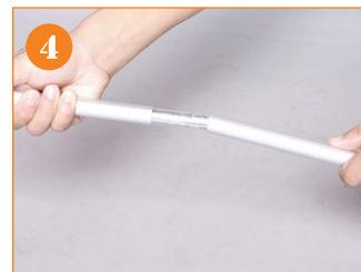
4. Connect the 3 section pole.