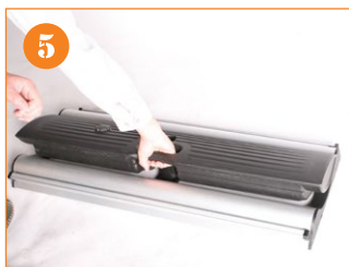
5. Place the water tank back into the base.