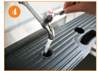
4. Add water into the tank.