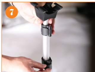
7. Open and close the clip to adjust the height of the pole.