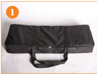
1. Vela canvas bag with stand.