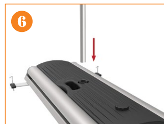
6. Insert the pole into the base.