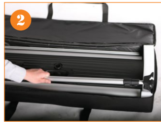
2. Take out the hardware and pole from the bag.