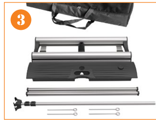
3. Place all the hardware parts on the ground.