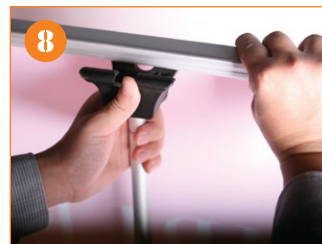
8. Pull one graphic and connect the pole hooks to the top profile.